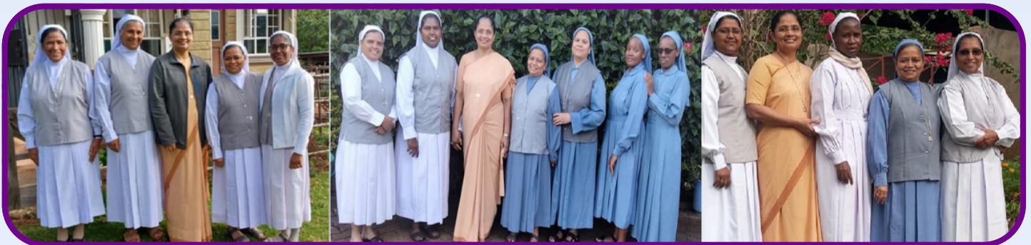
Visiting the Mission and communities in Kenya & Uganda, sharing their joys and smiles....