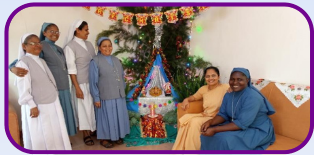
Christmas 2025 Celebration with the Monduli Communities, the Superior General, the General Bursar, and the Provincial Finance Team