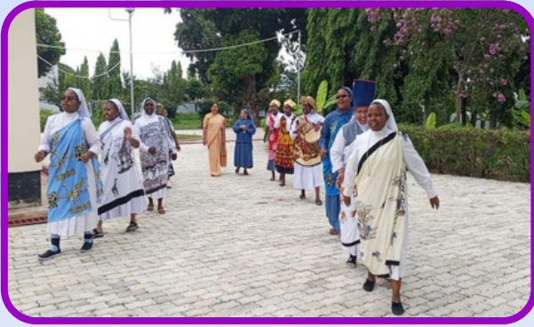
Being Welcomed at Tabora community