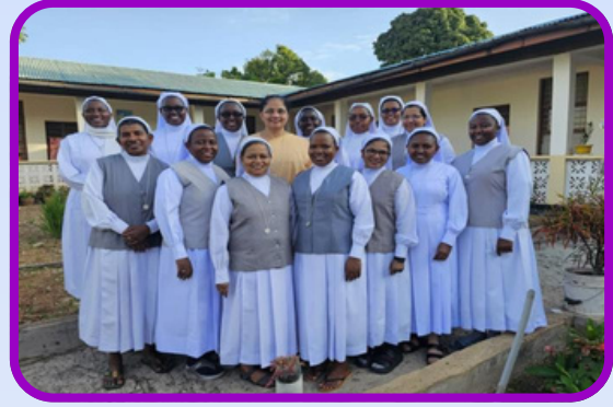
With all smiles and cheer....